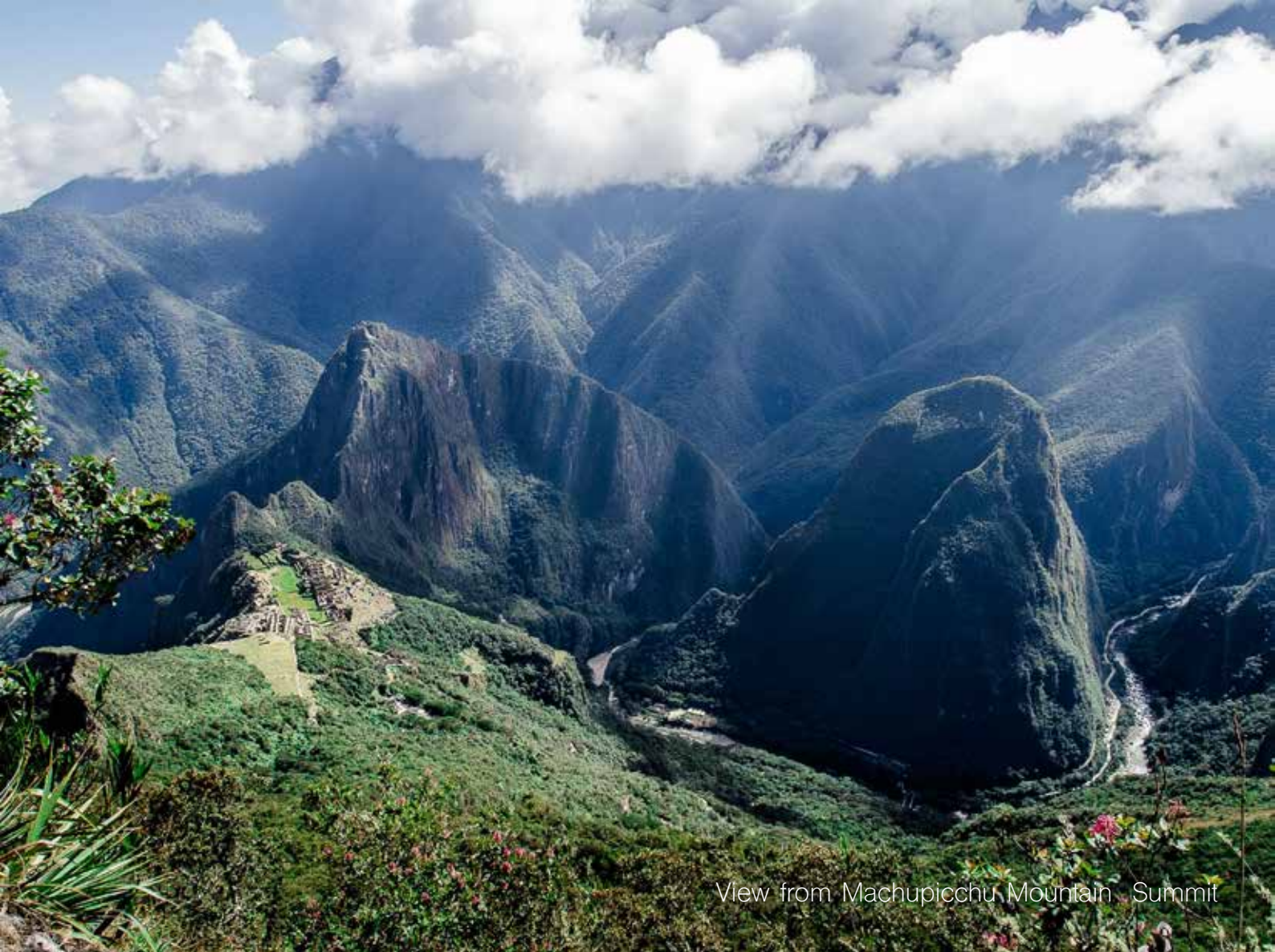
View from Machupicchu Mountain Summit