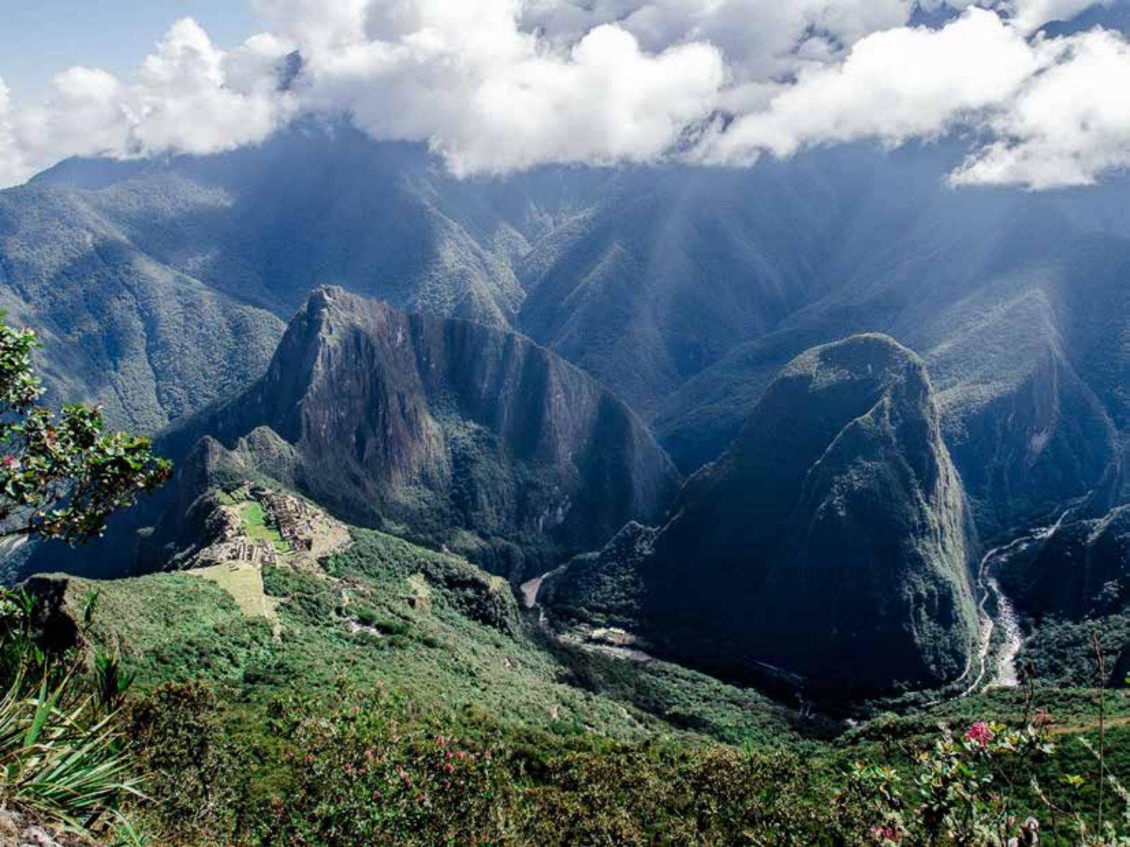
View from Machupicchu Mountain Summit